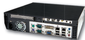
NTB5005: Includes TV Capture