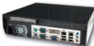
NTB5000: No TV Capture